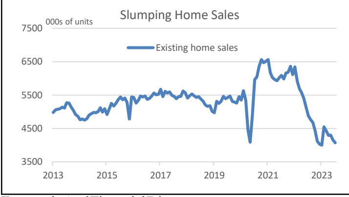
Economic And Financial Digest

But a recent study by the San Francisco Federal Reserve bank provides some idea of the magnitudes involved. The researchers calculated that households accumulated $2.1 trillion in excess savings from early 2020 to August 2021, that is savings over and above what they would have saved during normal times. Since August 2021, they have dipped into that pool deeply to support spending,