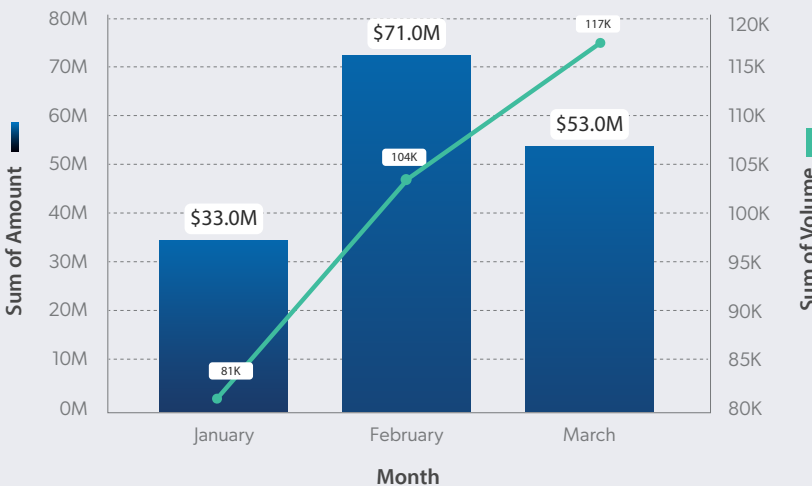
Real-Time Payments Volume and Dollars

RTP transactions climbed steadily in the first quarter of 2025, increasing 44%.