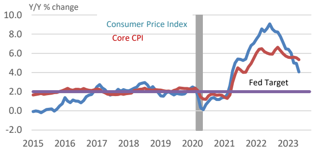
Declining Headline But Sticky Core Inflation

So far, conditions have held up better than expected, raising the happy prospect that the Fed can accomplish its goal of taming inflation without causing a recession – the so-called soft landing that it set out achieve at the start of the rate-hiking cycle. But it's far too early to declare victory on inflation. True, consumer price increases have eased considerably this year; the annual increase in the consumer price index has slowed for eleven consecutive months, from a peak of 9 percent last June to 4.1 percent in May. But plunging energy prices and slower increases in food prices accounted for much of that slide and are not reflective of the